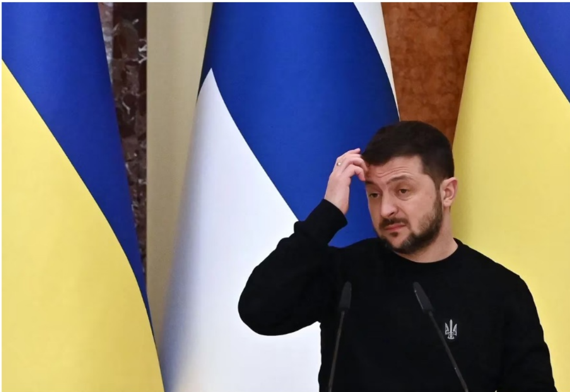
Ukrainian President Volodymyr Zelensky during a press conference in Kyiv, on January 24, 2023.

Fresh off his U.S. fundraising tour, Ukrainian President Volodymyr Zelensky accepted the resignation of his deputy chief of staff and removed several other top officials this week, taking a tough line toward a series of corruption scandals at a time the country is appealing for more Western military support.